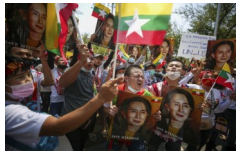
Myanmar Protest

(The following report is from Broadcasters in Myanmar and has been edited to protect the authors and the work in that country.)