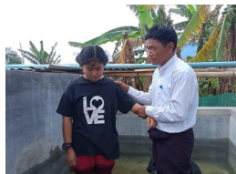
22 year old Hindu Nepalese young lady baptized into Christ.

“The situation is still uncertain here. But the group that from people-elected party has just announce they are ready to fight against the Military government. So sure there might be civil war 80%. We are all preparing for food and other stuffs to store again. And at the same time, the Covid-19 active cases are raising enormously. Even only in (our city), there are up to 50 active case here. So the shopping marts are starting to close. We better prepare now. Please pray for us and for Myanmar for peace and to be blessed. God bless you”